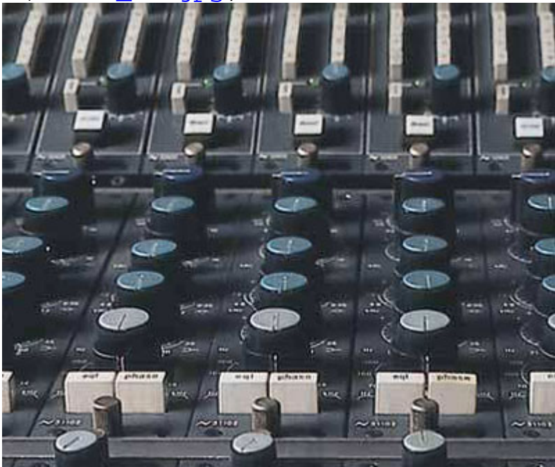
7) suitcase detail.jpg , downloaded 827 times