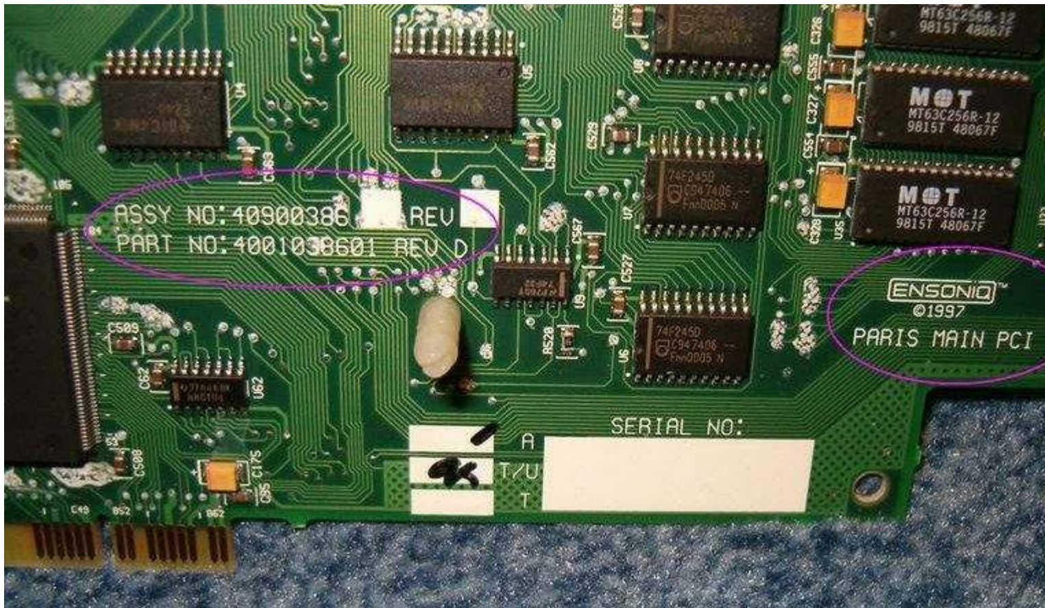
3) EDS daughter.jpg , downloaded 106 times