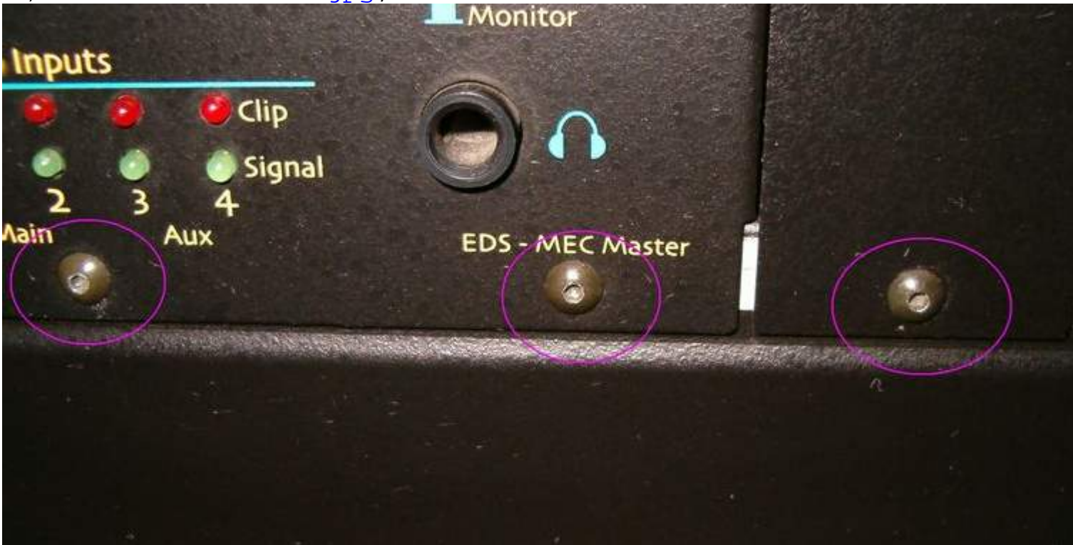
9) Newer MEC black.jpg , downloaded 66 times