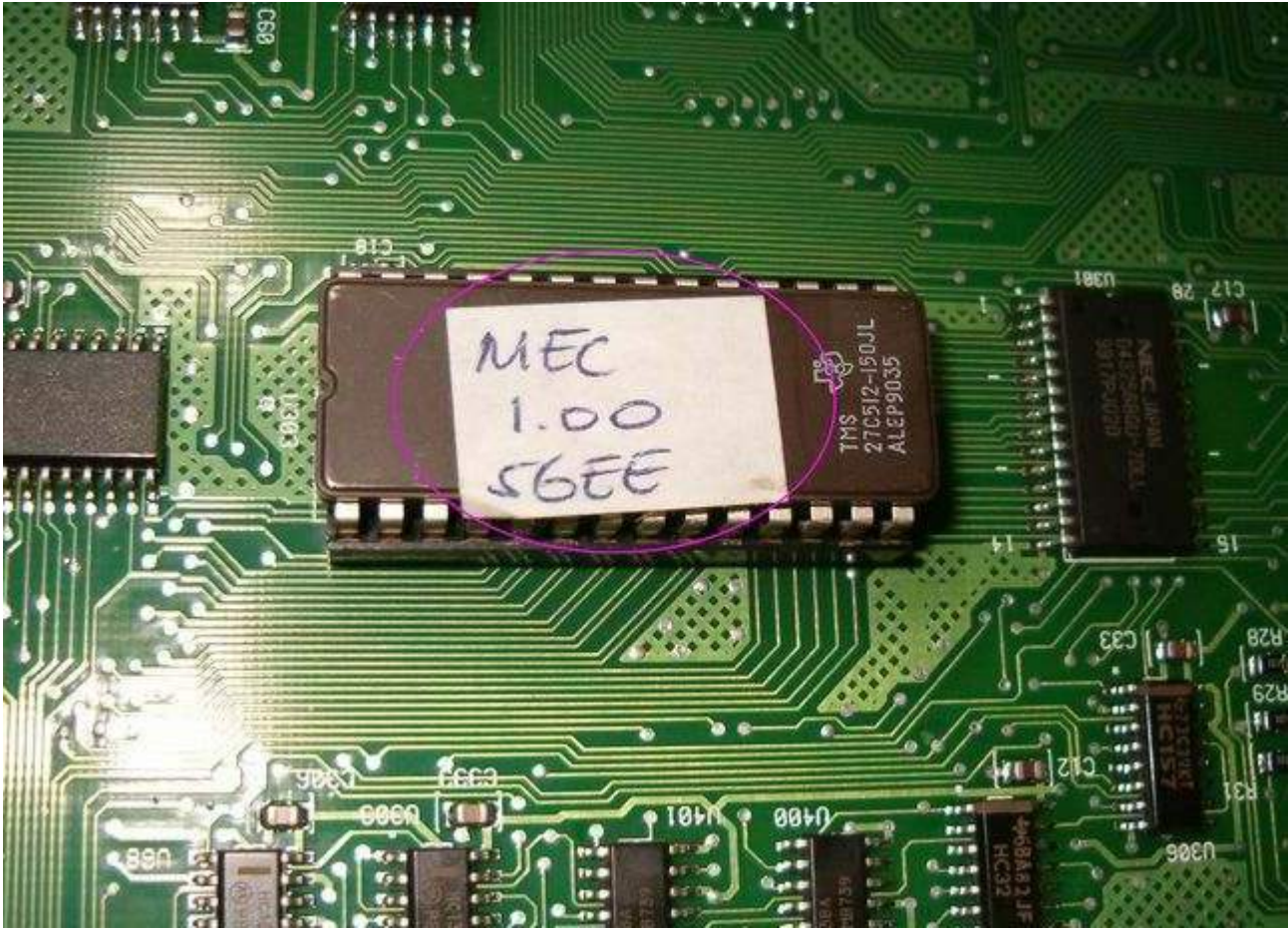
6) ADAT blue.jpg , downloaded 79 times