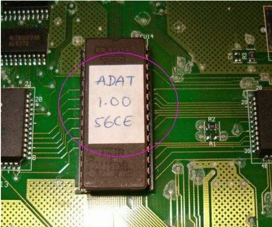
8) Oldest MEC black.jpg , downloaded 76 times