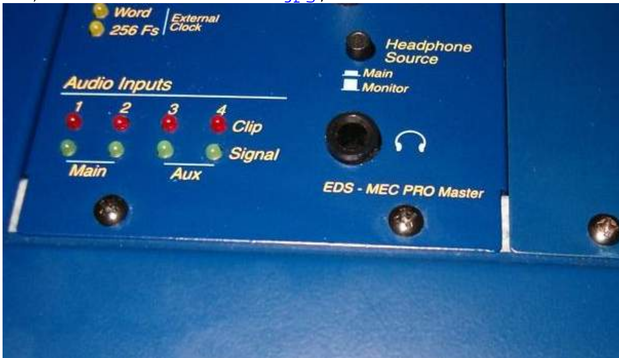
11) Version information.jpg , downloaded 81 times