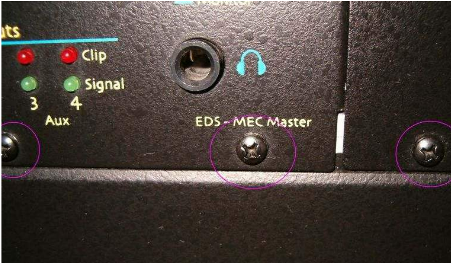
10) The newest MEC blue.jpg , downloaded 87 times