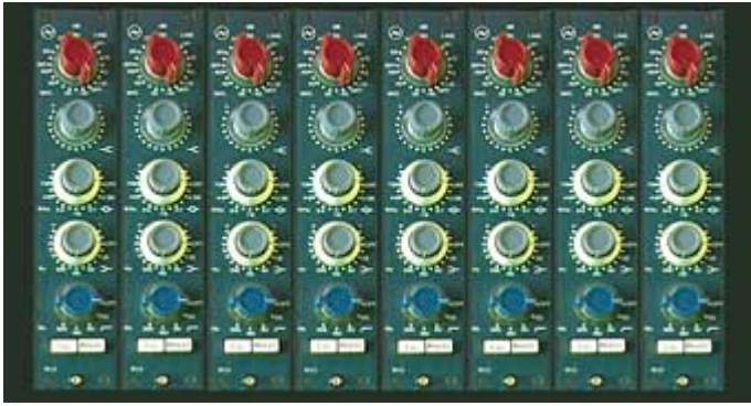
4) neve suitcase.jpg , downloaded 706 times