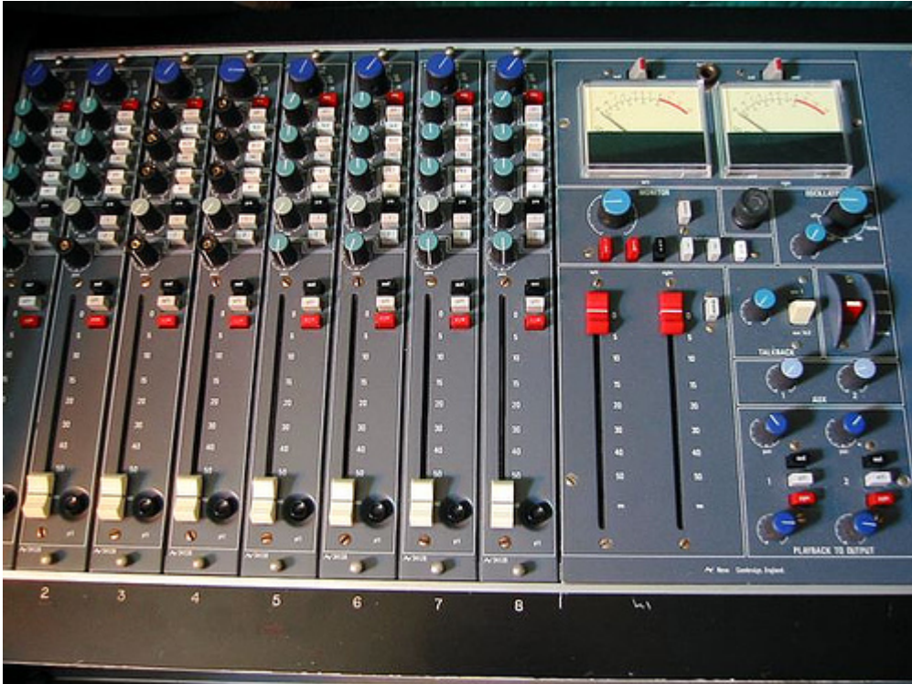
5) neve_01.jpg , downloaded 709 times