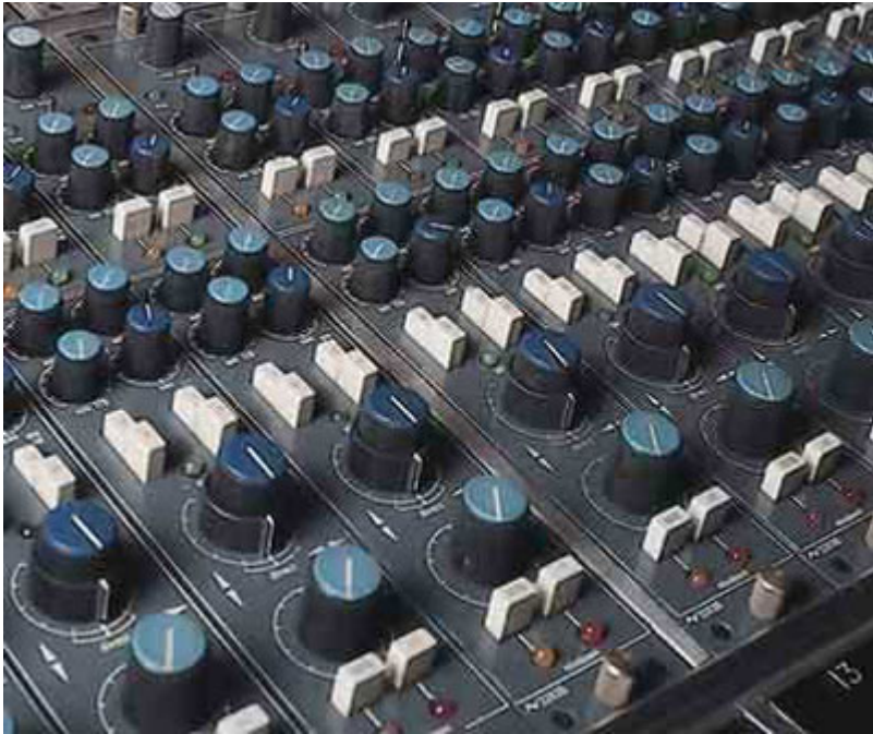
6) neve_02.jpg , downloaded 702 times