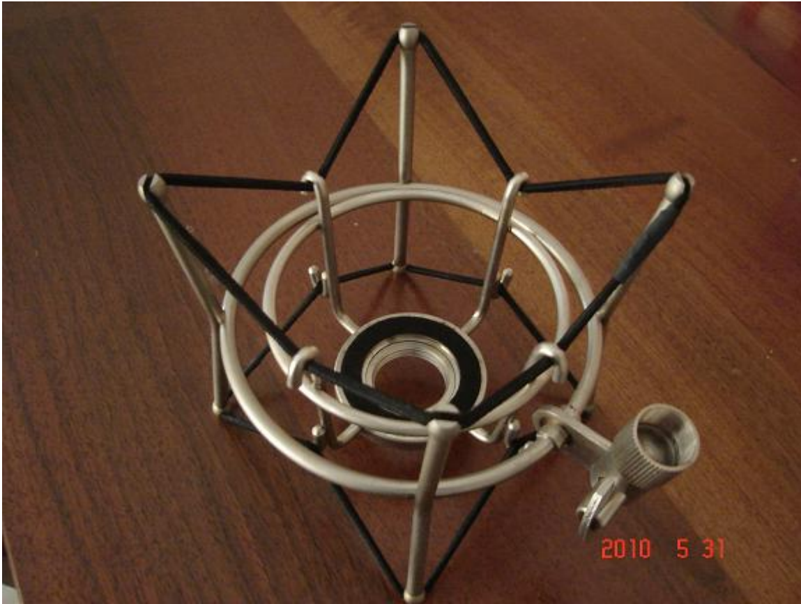
3) muse47_photo5.JPG , downloaded 447 times