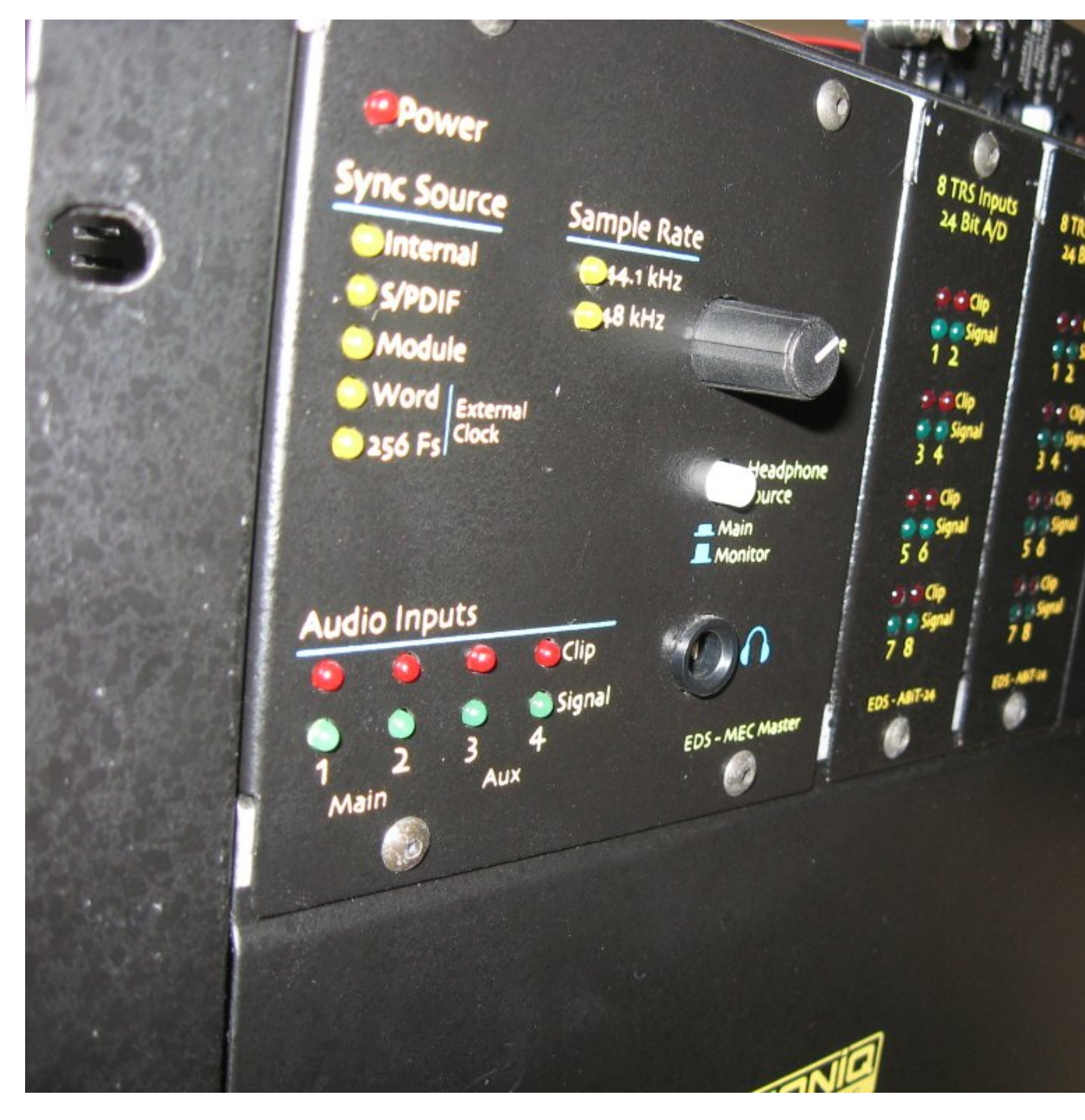
4) Img_3560.jpg, downloaded 3276 times