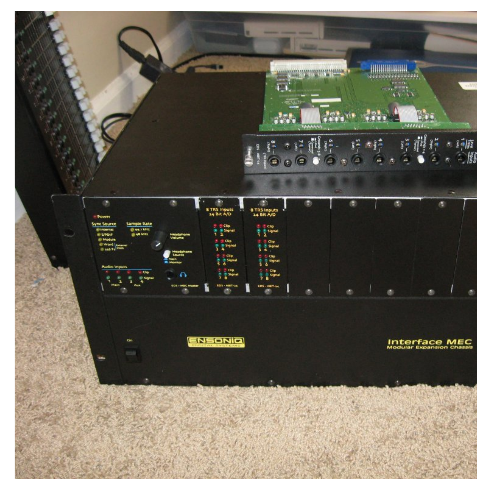
2) Img_3558.jpg, downloaded 4437 times