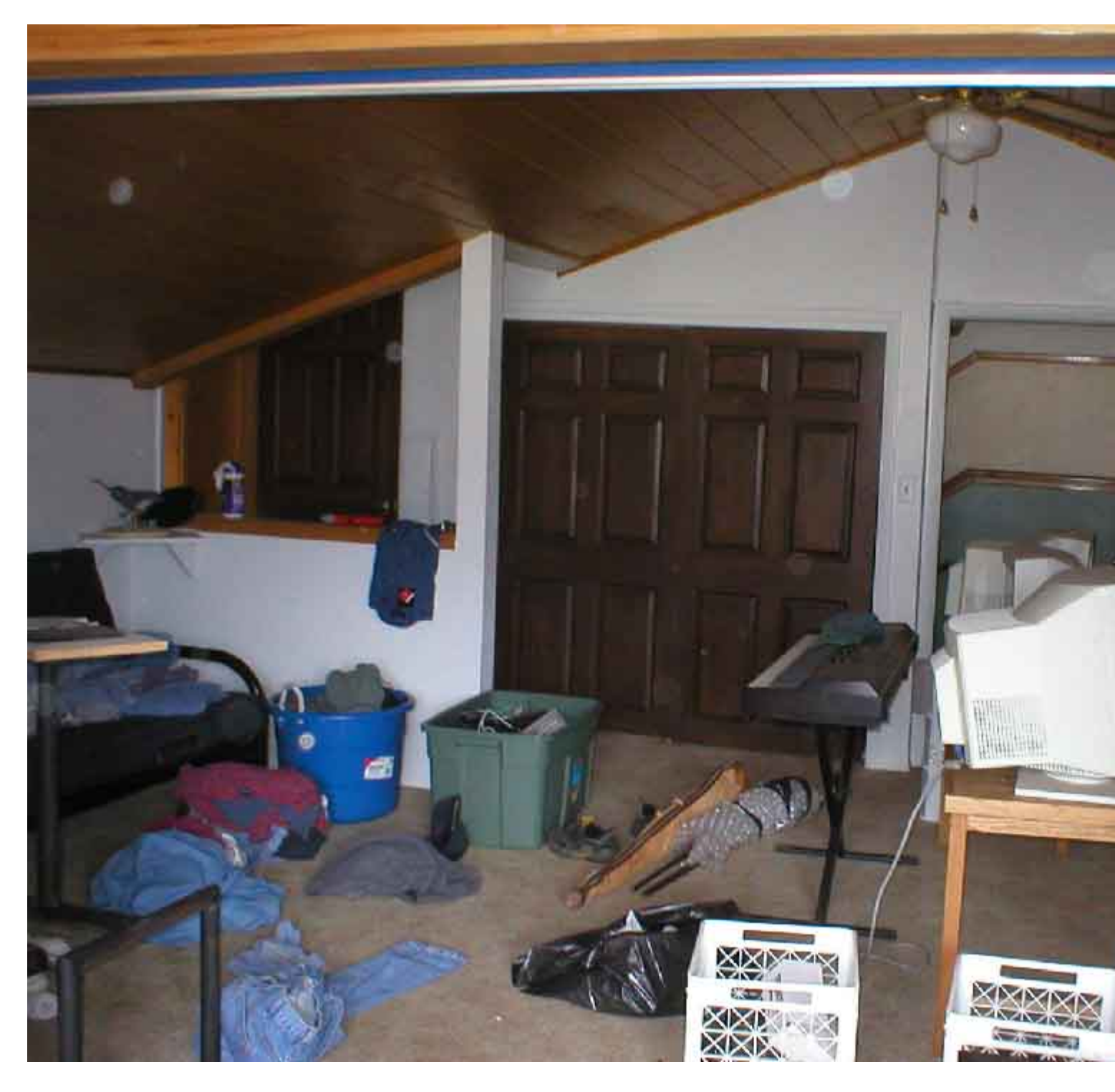
2) CR monitors.JPG, downloaded 63 times